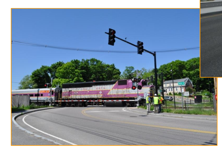
A Four-Quadrant At-Grade Crossing Intertied with a Traffic Signal in a Quiet Zone at South St., Hingham, MA

A Four-Quadrant At-Grade Crossing Intertied with a Traffic Signal in a Quiet Zone at Hersey St., Hingham, MA