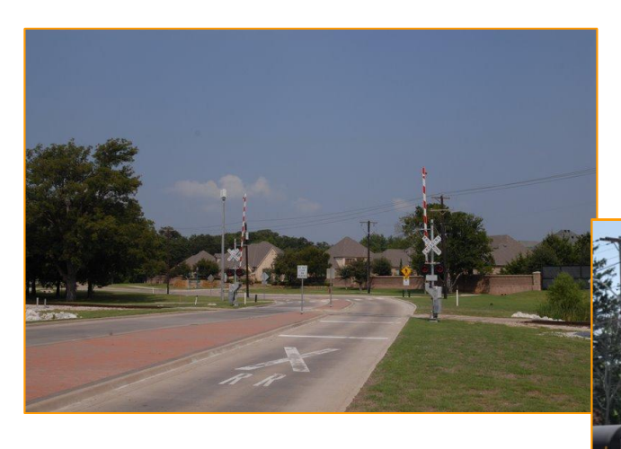
Typical Grade Crossing with a Center Median