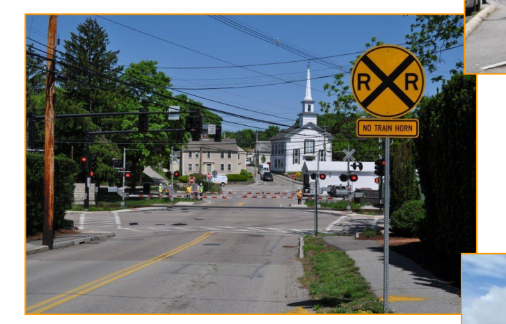
Commercial Street At-Grade Crossing in Braintree, MA with Flashing Lights and Four-Quadrant Gates

A Four-Quadrant At-Grade Crossing Intertied with a Traffic Signal in a Quiet Zone at Hersey St., Hingham, MA